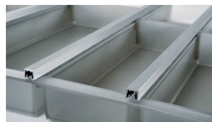
▶ Graphite translucent with profiles in stainless steel look