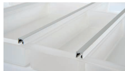
▶ White translucent with aluminium profiles