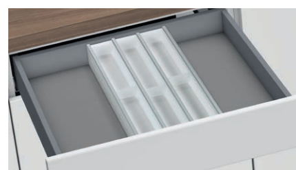
▶ cuisio universal including non-slip mat