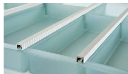
▶ Green translucent with aluminium profiles