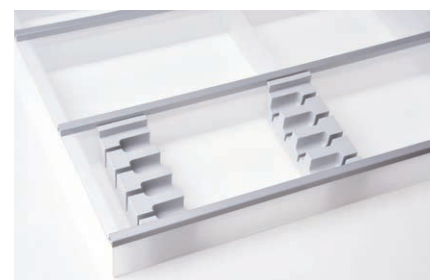
Knife block/side end panel