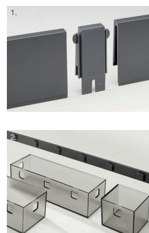
1. Connector 2. Positioning rail